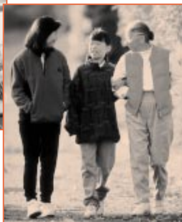
JIM CUMMINS/IFG INTERNATIONAL